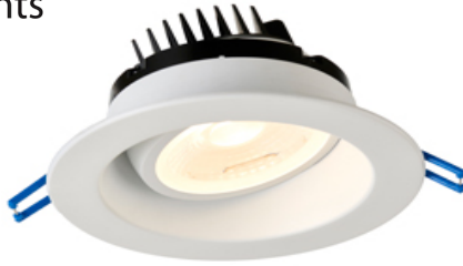
Type IC, Wet & Air-Tight