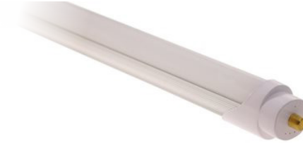
T8 Tube V2 8FT, 1 Pin T96T8-xxK-V2-1P