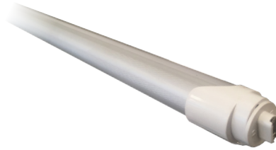
T8 Tube V2 8FT, R17D T96T8-xxK-V2-HO